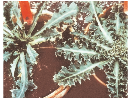
Figure 6. Rosette weevil larvae feed on the growing center of the plant, producing a necrotic area (left). Healthy plant at right.

leaf tissue. Mating takes place shortly thereafter, and subsequent egg laying occurs during the fall and on warm days during the winter. These same adults overwinter and resume egg laying the following spring until about May 1. The eggs are usually laid in the midrib on the underside of rosette leaves or placed directly in the rosette crown. In late spring, some egg laying can be found in secondary buds.