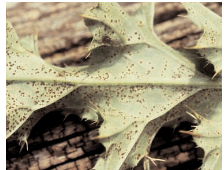
Figure 9. Musk thistle rust fungus appears as brown pustules on the underside of leaves.