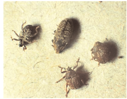
Figure 4. The musk thistle flower head weevil (top, center) coexists with the smaller rosette weevil.

requiring a spring seedbed preparation. Tillage easily eradicates rosettes established during the preceding summer or fall.