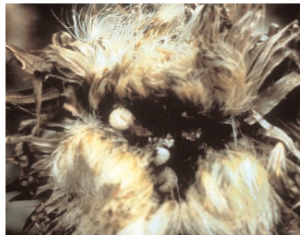
Figure 8. Flower head larvae feed in the base of the flower head, exposed here.