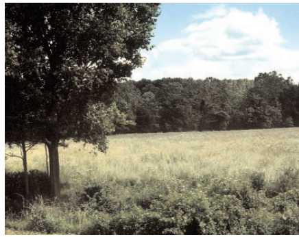
Figure 5. Musk thistle dominated this field (left) in 1975, before introduction of the flower head weevil. By 1985 the field was nearly clear of musk thistle (right).