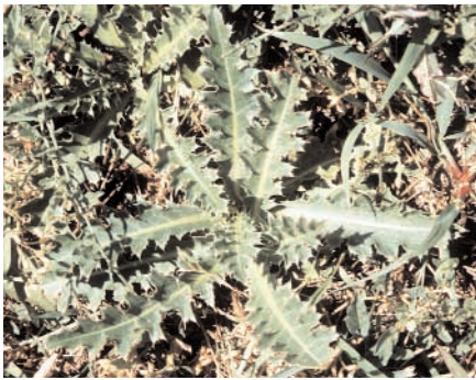
Figure 2. After seed germination, a rosette develops.