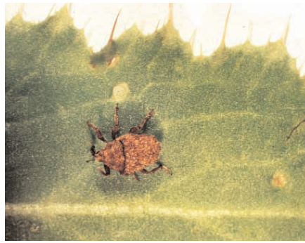
Figure 3. The musk thistle rosette weevil feeds on rosette leaves.