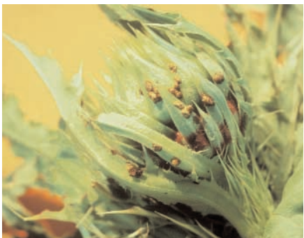
Figure 7. Flower head weevils lay eggs on the bracts of developing flowers.

A third biological control agent for musk thistle is a rust fungus ( Puccinia carduorum ). This exotic disease of musk thistle was introduced from Turkey and released in Virginia in 1987. By 1997 it was detected in